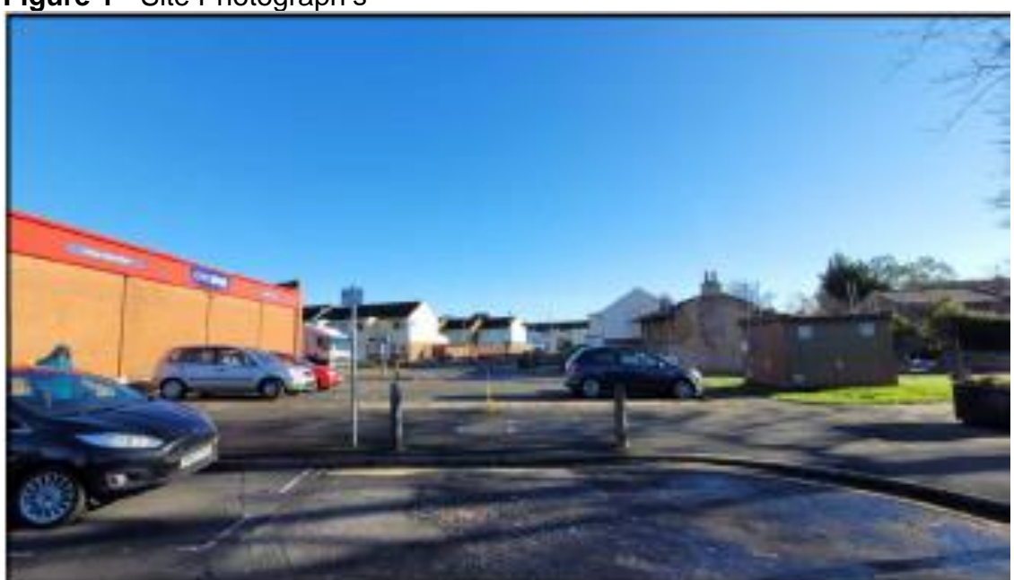
Figure 1 - Site Photograph's

Proposed location of a new mast shown above will assimilate well into the immediate street scene and not be detrimental.