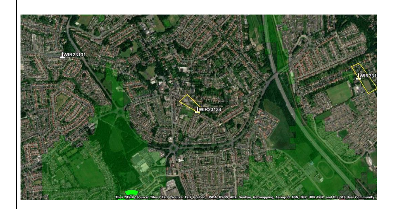
Figure 4 - Coverage Map: Proposed installation must be located close to the area shown below.